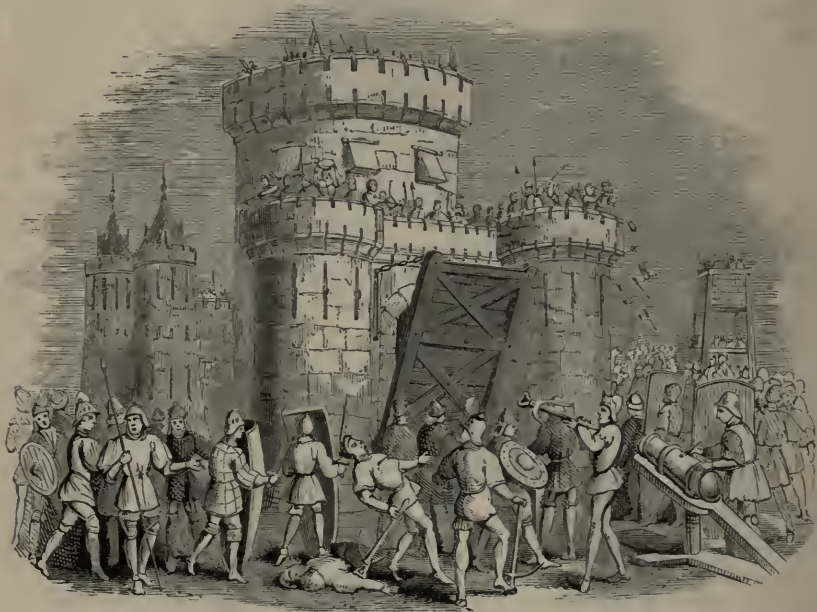
ATTACK ON THE FORTIFICATIONS OF PONTEVEDRA. Composed from Harleian MS., 4425, and MS. Froissart of the 15th century.